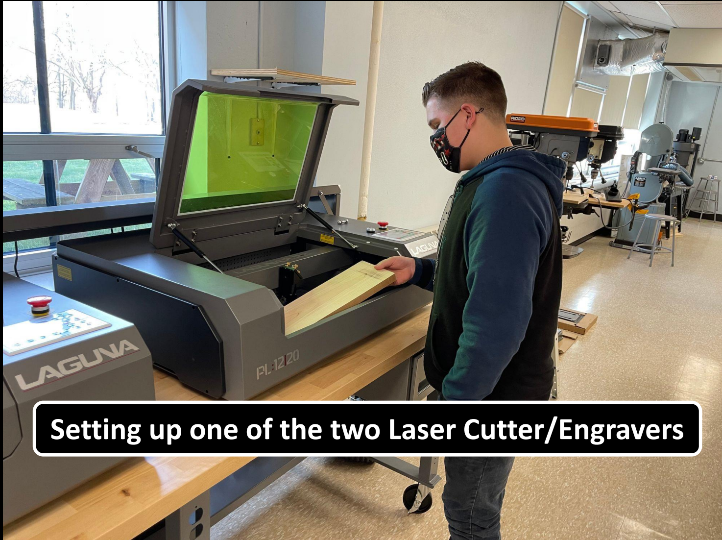
Setting up one of the two Laser Cutter/Engravers