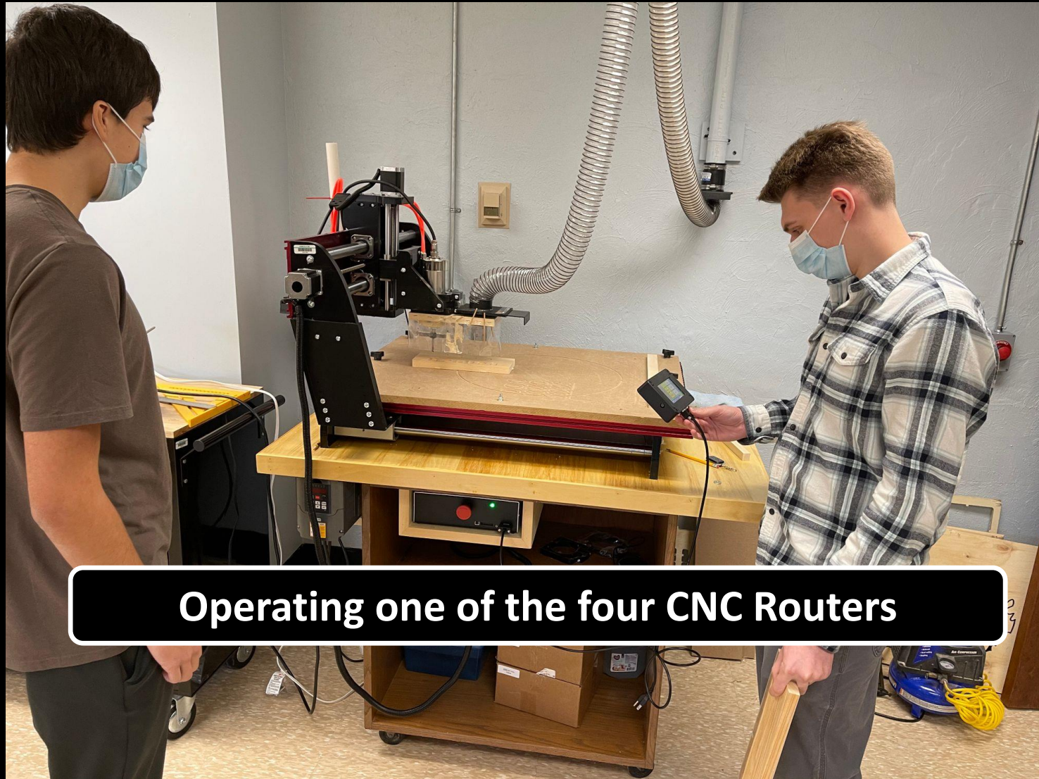
Operating one of the four CNC Routers